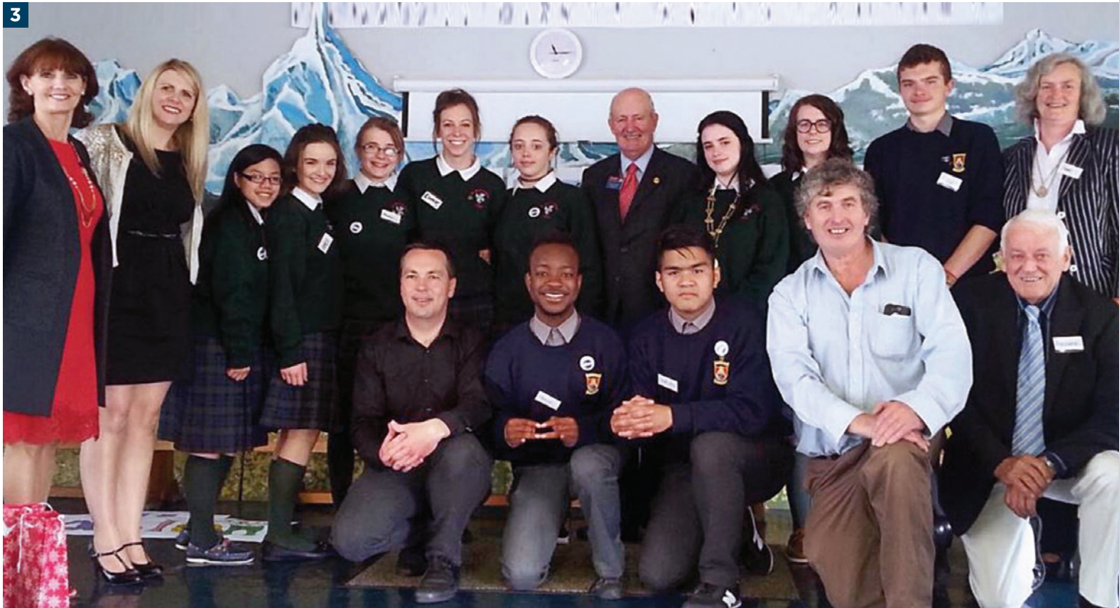
Toastmasters and professional educators join forces around the world to mentor students younger than 18 through the Youth Leadership Program, including the students shown here, in 1. Hungary; 2. South Africa; 3. Ireland; and 4. The United States.